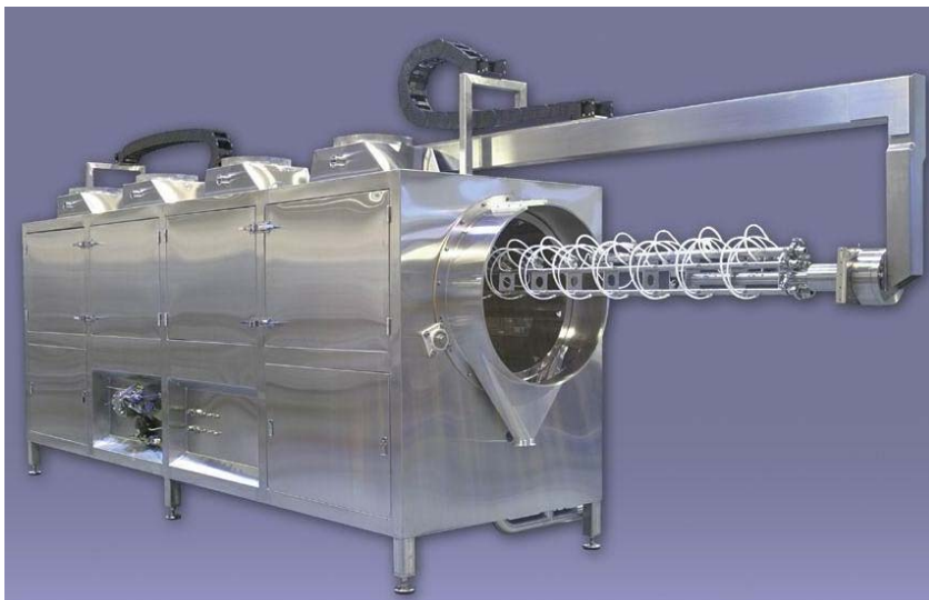
Figure 1. Continuous Coating Pan (O'Hara Technologies)

Two trials were conducted in a 30" diameter by 15' long continuous coater (Model HVCC-3015, O'Hara Technologies) (Figure 1) equipped with 28 spray guns (Model S37, Schlick). The spray guns were divided into five independently controlled blocks.