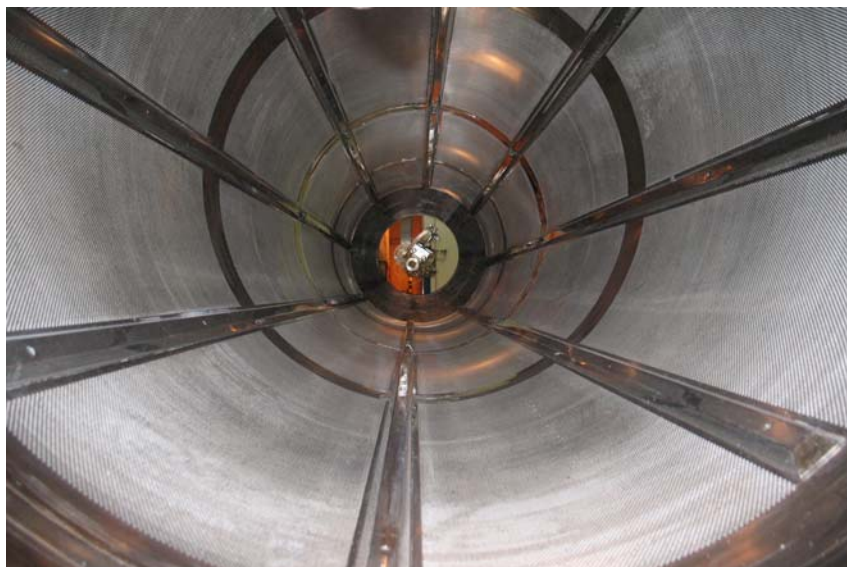
Figure 2. Interior of the Continuous Coating Pan (Spray Gun Manifolds Removed)

The continuous coating pan was also equipped with a pneumatically controlled weir plate at the discharge end of the unit that, in a lowered position, contained all tablets within the pan or when raised, controlled the flow of tablets into the discharge zone of the pan. This control mechanism is an enhancement over earlier continuous coater technology and allows for coating of tablets in both batch and continuous modes. Another difference in this equipment versus earlier continuous coating pan designs is the absence of baffles throughout the pan interior (Figure 2). Other than anti-slide bars, tablet movement through the pan is solely controlled via tablet in-feed rates and the height of the weir plate at the discharge end of the pan.