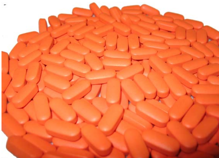
Figure 3. Coated Tablets Sampled from the Discharge of the Coating Pan While Running in Continuous Mode

Instrumental color testing of samples pulled throughout the trials confirmed the positive visual assessment of color uniformity. In the batch mode trial, 250 kg of tablets were uniformly coated to the 3.0% target weight gain in < 14 minutes. Uniform target color of < 2 ΔE from reference (actual 0.4 ΔE) was achieved in < 9 minutes of coating time (Figure 4).