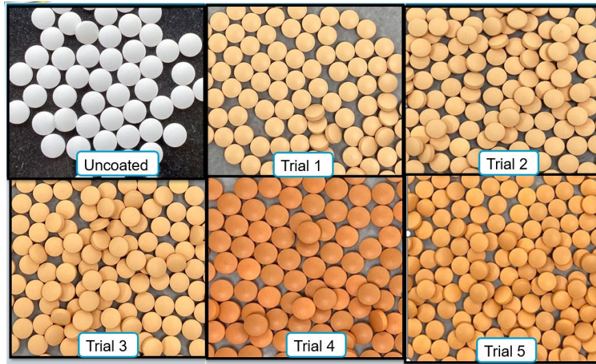
Figure 1: Surface Appearance for Uncoated vs Film Coated Tablets

Assay, Impurity Testing and Dissolution Testing for Sitagliptin: The sitagliptin content of the uncoated and film coated tablets (Trials 1-5) was within acceptable limits of 95-105% at both the initial and end of 3M accelerated stability storage (Figure 2). Impurity profile was NMT 0.2% (limit is 1%) up to 3M upon stability storage for all film coated tablets, indicating Opadry TF film coating system did not result in drug degradation. No significant difference in drug release was observed for all the film coated tablets at initial and accelerated stability conditions of 40°C/75% RH (Figure 3).